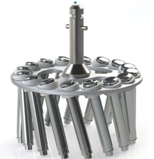
Punch holder EU19