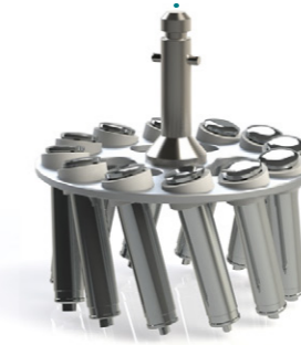
Punch holder EU1"