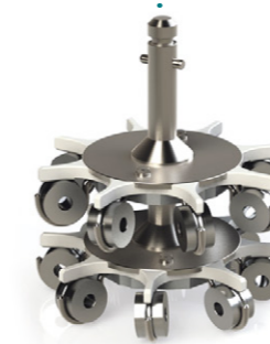
BBS, B, BB or D die holder

Easy and quick change of format holders.